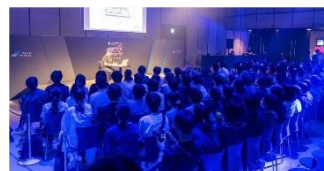
<VIDEOGRAPHERS TOKYO 2022 (June 2022) >

• Sessions for families (Cooperation with “KANSAI Photo Club SHARE”) We are planning a stage for families with children to enjoy and hands-on workshops.